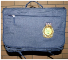
Bag - $12

The pocket for the Computer is padded for extra protection. Anniversary logo embroidered.