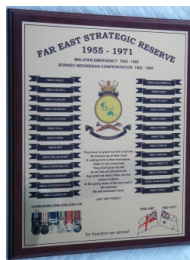
Honour Board $105-00

Item 8: - Medallion commemorating RAN Centenary (1911 – 2011).