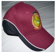
Cap - $10

Item 3: - Cap. FESR 55th Anniversary Crest.