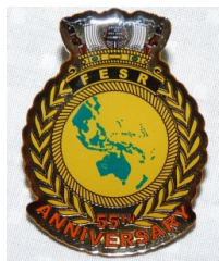
Badge - $2-50

Item 4: Epoxy filled FESR 55th Anniversary Lapel/Cap Badge.