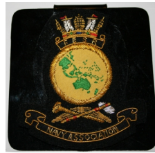
Pocket PVC mount