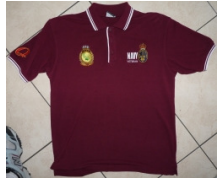
Polo Shirt - $20

Item 2: - Embroidered polo shirt. Navy badge and FESR 55th Anniversary Crest. No small or medium available.